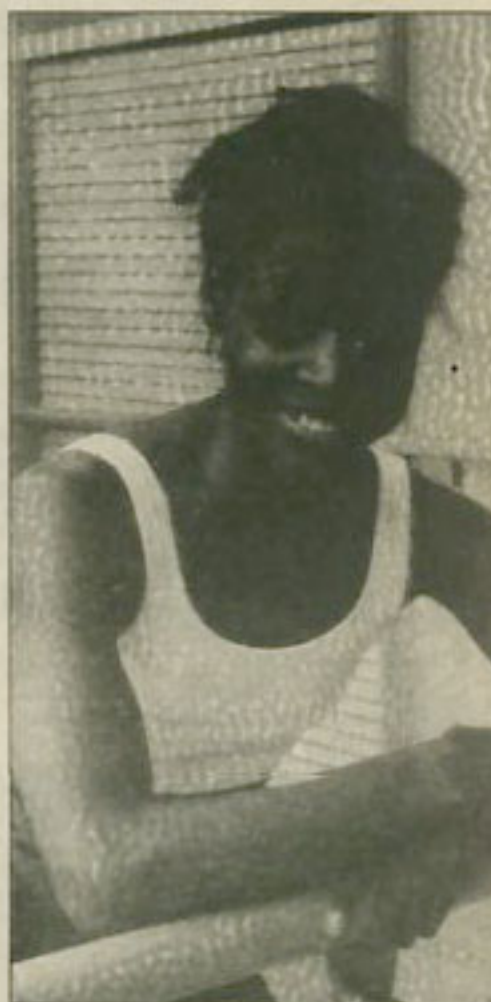
Proud of her image — fitness expert

Now it becomes increasingly clear that the scan missed something — I