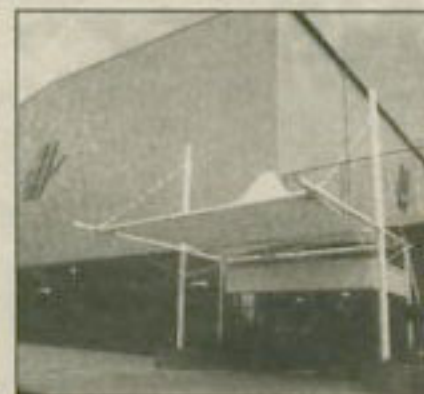
The Harbour Club in Chelsea

THE cost of looking like Diana is not just a physical work-out, you have to get your flexible friend working as well.