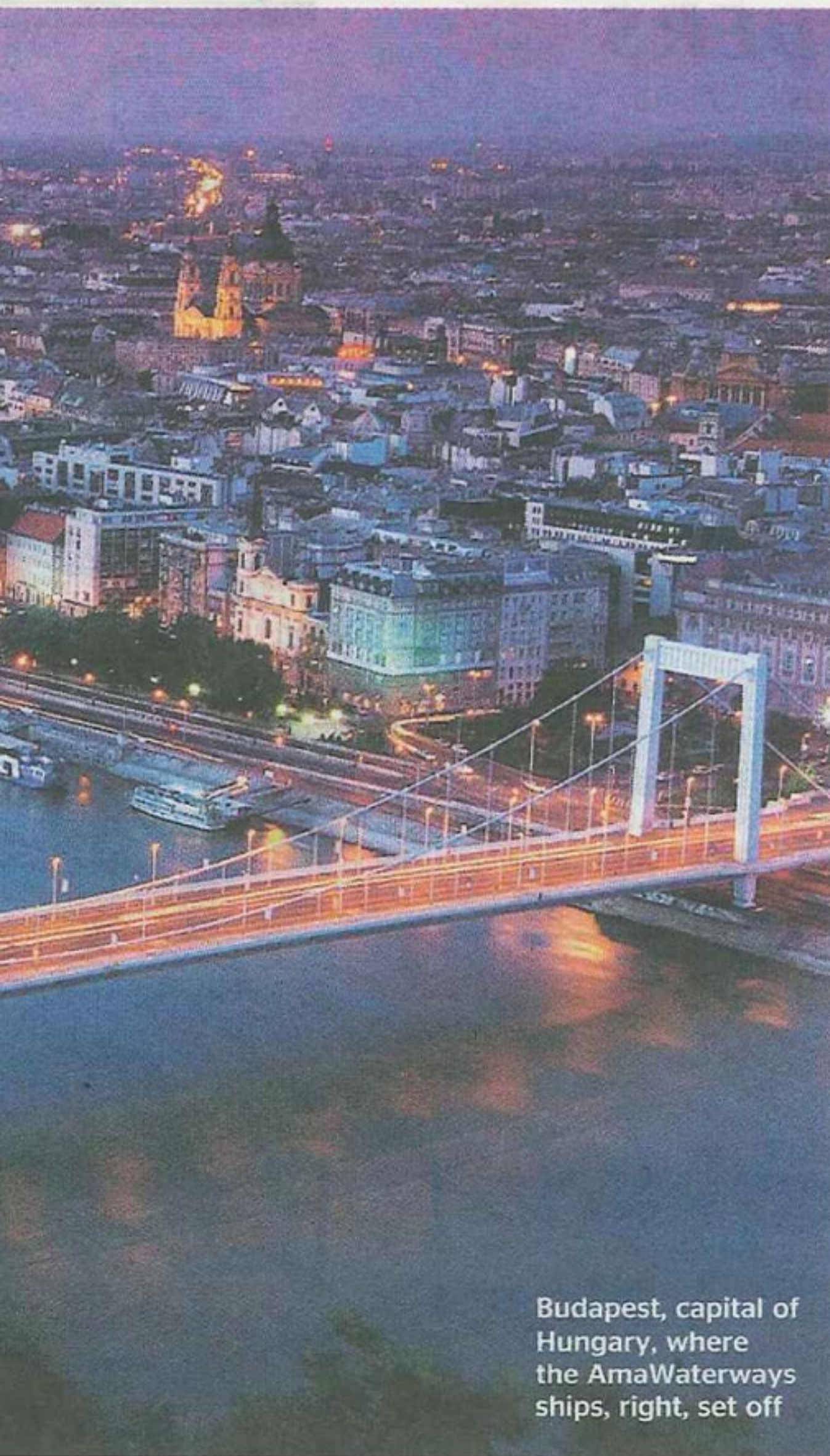
Budapest, capital of Hungary, where the AmaWaterways ships, right, set off

Balkan mountain ranges. From the deck we take in national parks, cliffs rising to more than 1,600ft, with trees clinging dramatically to rock faces. In the morning, we watch the sun rise behind forest-clad mountains tipped with mist.